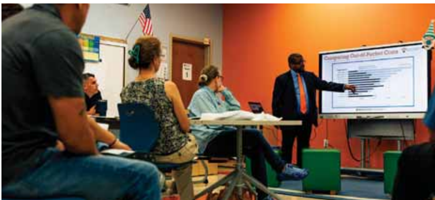
Parents of students participate in a college admission class during the Pathways to College & Career Conference on Marine Corps Base Quantico, Virginia.

With disciplined planning and consistent execution, you can provide your children with the opportunity to obtain a quality college education without the burden of student loan debt, preparing them for a successful future.