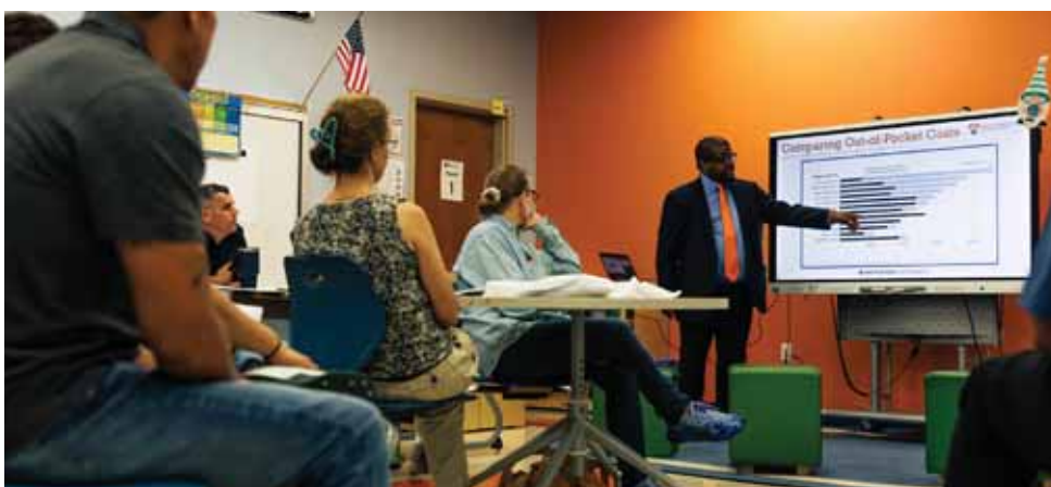
Parents of students participate in a college admission class during the Pathways to College & Career Conference on Marine Corps Base Quantico, Virginia.

With disciplined planning and consistent execution, you can provide your children with the opportunity to obtain a quality college education without the burden of student loan debt, preparing them for a successful future.