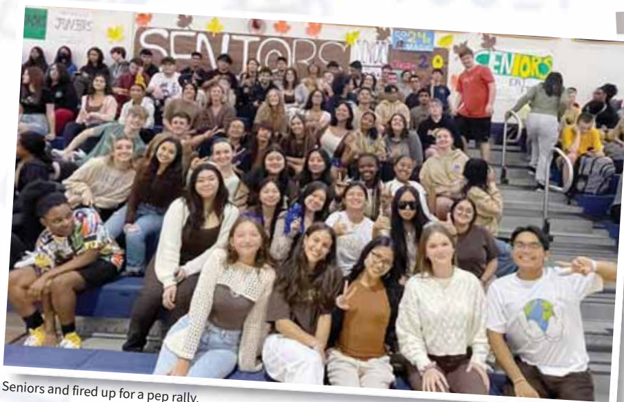
Seniors and fired up for a pep rally.