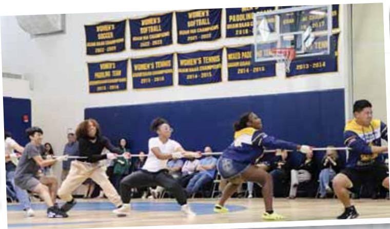
Life is a game of tug of war.