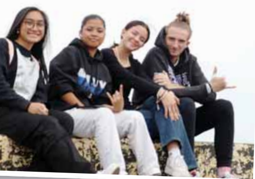
the bell to ring.