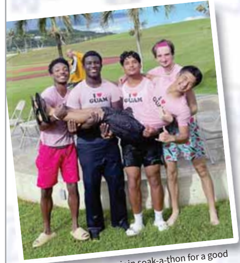
Senior football players join soak-a-thon for a good cause.