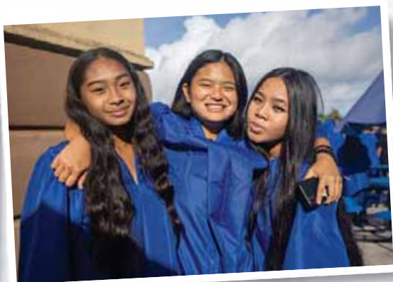
We made it!