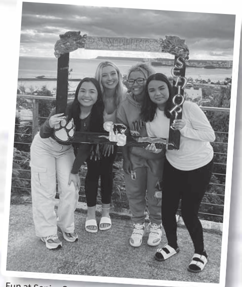
Fun at Senior Sunrise.