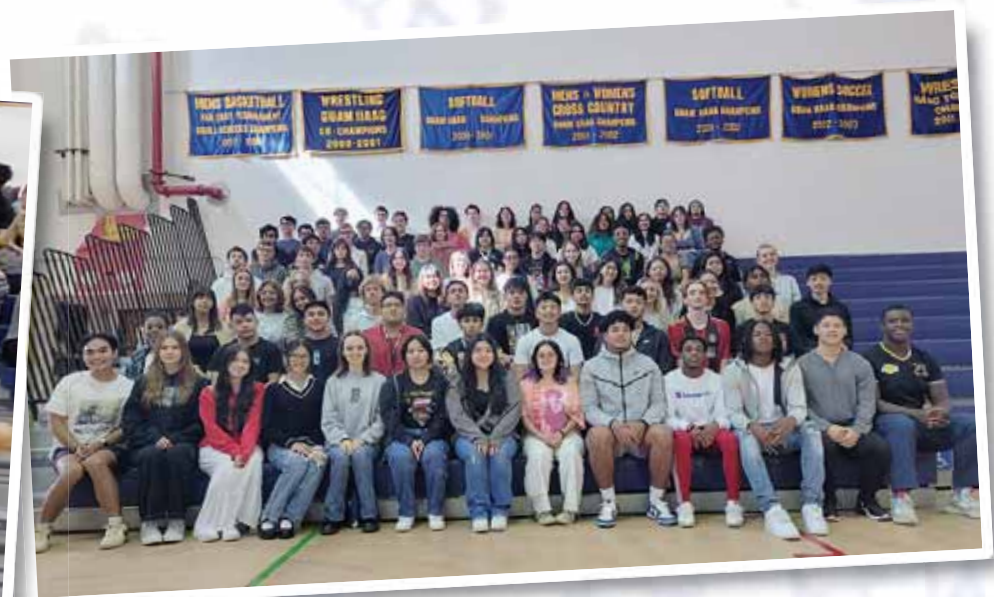
Seniors last first day.