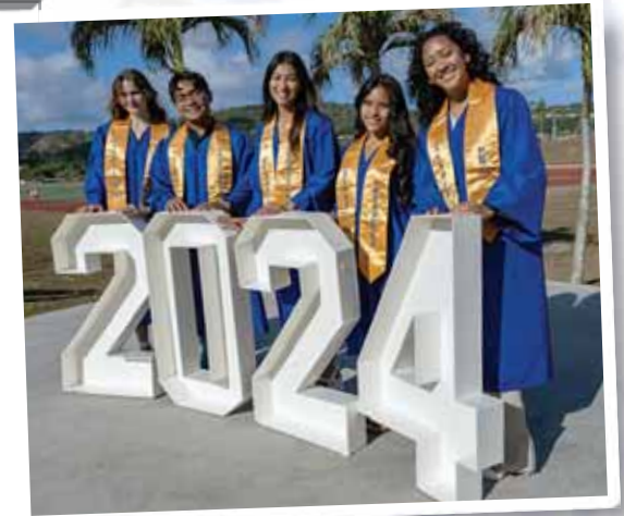
Senior Class Council Members.