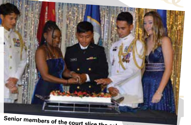
Senior members of the court slice the cake at the Military Ball.