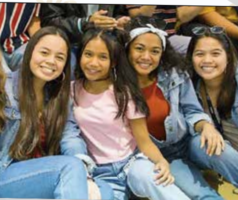
Members of the Student Council.