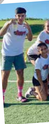
Seniors participating in sports.