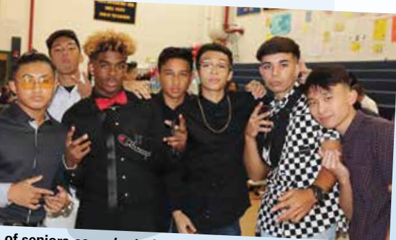
Some of seniors serve looks for the Homecoming Dance.