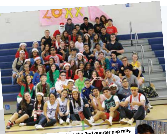
The senior class shows spirit at the 2nd quarter pep rally.