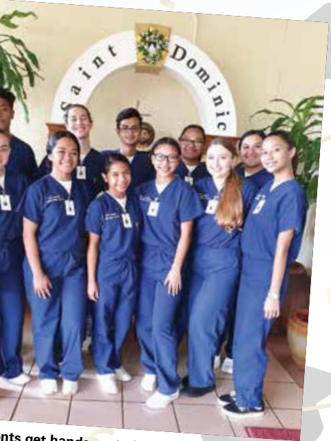
Students get hands-on training at Saint Dominics

With Much Appreciation, GHS Class of 2020