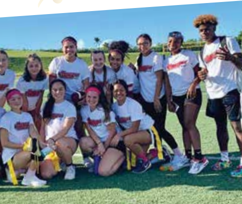
Students in the Powder Puff football game.