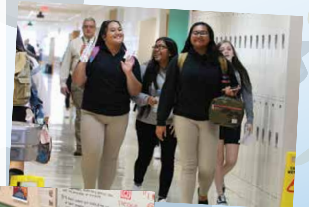
Heading to class.