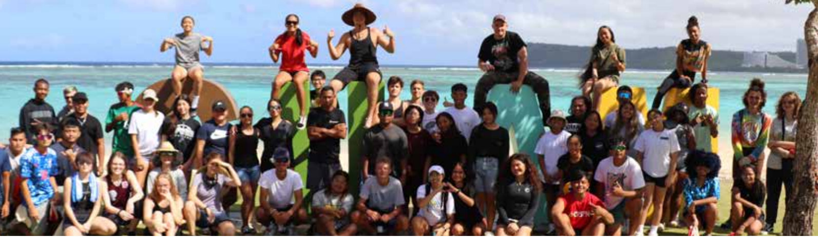
iors clean up Ypao beach during the Guam High Gives Back event Feb. 7, 2023.