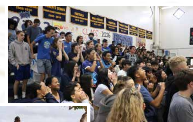
Cheer your Panther hearts out!