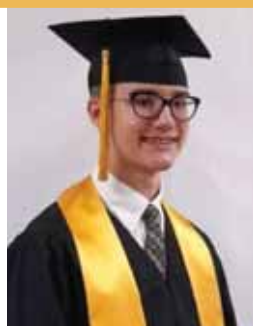
Congratulations!! We are so very proud of you and your many accomplishments!! You can do anything. We love you!! Mom & Dad