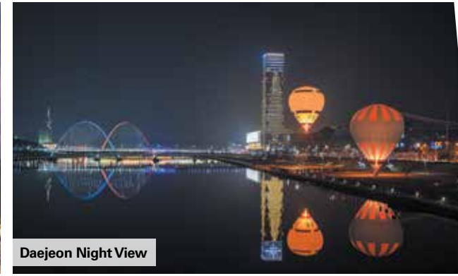
Daejeon Night View