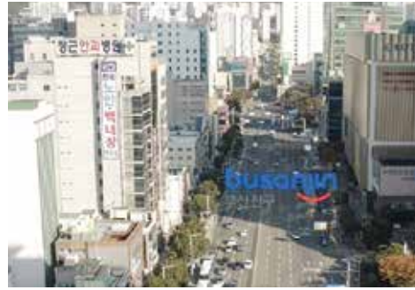
price (compared to other areas). The Seomyeon Medical Street

At Seomyeon Medical Street's medical institutions, staff with medical knowledge and experience accumulated through Korea's excellent medical schools and specialist courses, are waiting for you. If you come to Seomyeon Medical Street, you will receive first-class medical services at a reasonable