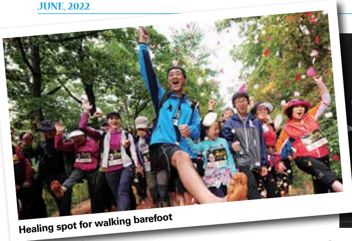
Healing spot for walking barefoot