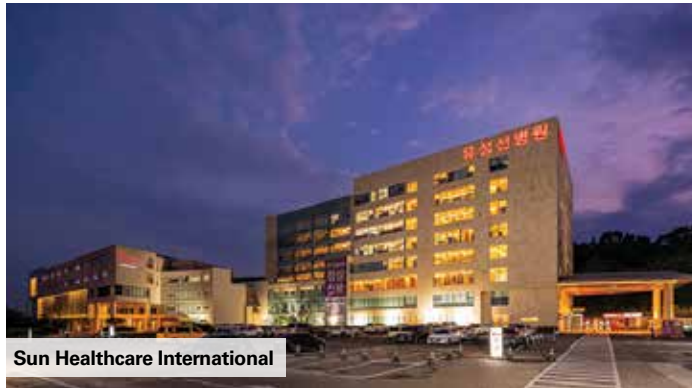
Sun Healthcare International

The ‘93 Daejeon Expo’, which showcased the latest science and technology at the time, such as electric vehicles, solar cell vehicles, and artificial intelligence robots, attracted 14.5 million visitors. A bio company located in Daedeok Innopolis, a domestic birthplace of science and technology, has developed and exported COVID-19 diagnostic kits around the world. Various forms of research and new technologies are being developed for human health. In addition, Daejeon, home to over 2,000 medical institutions equipped with excellent medical staff and advanced equipment, is an ideal medical tourism destination with premium health checkups for foreign patients and wellness tourism resources.