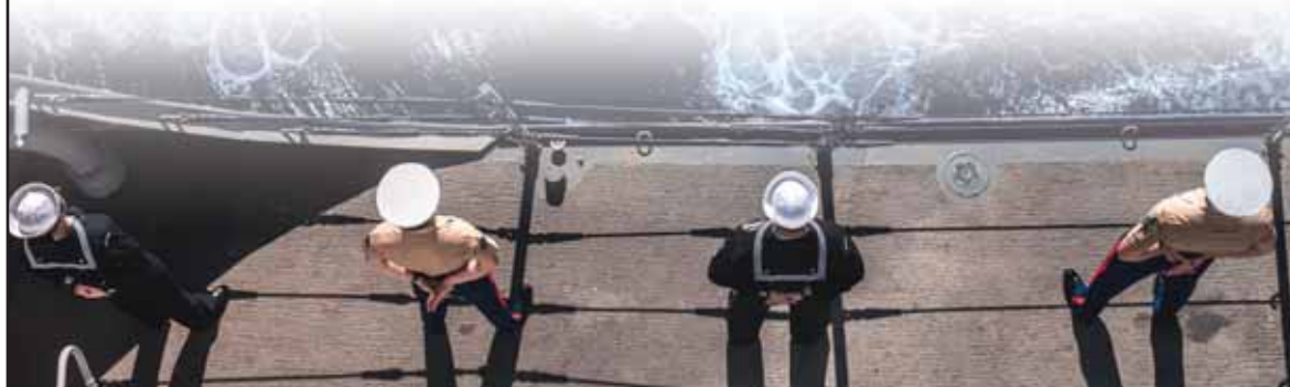
Photo courtesy of the United States Department of Defense. The DOD does not endorse any company or their products or services.

To find how we can help protect your loved ones, call us at 888-300-9331 or visit NavyMutual.org.