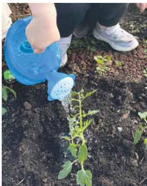
A preschooler waters plants in a new planter bed in Vicenza.

agreed to waive registration fees for military children.