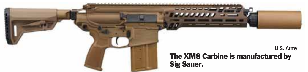
U.S. Army The XM8 Carbine is manufactured by Sig Sauer.

The Army only standardized the M7 as its primary rifle last year, but the XM8 is not intended to replace it. Instead, it would be a companion weapon. The XM8 is about 5 inches shorter and roughly 1 pound lighter than the M7 and features a fixed buttstock.