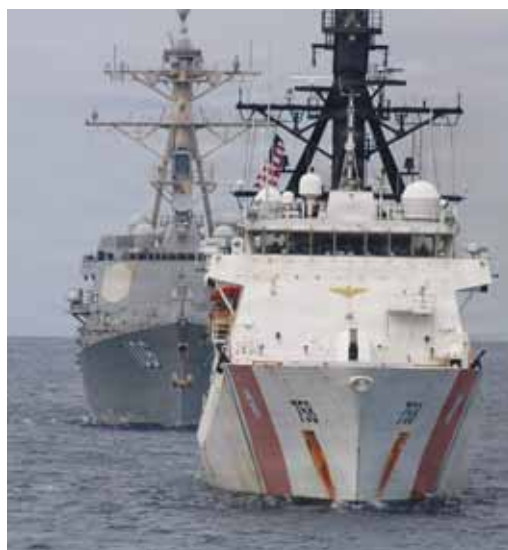
U.S. Coast Guard Atlantic Area