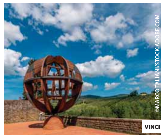
VINCI