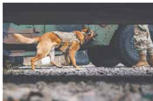
Military working dog Lucky searches military vehicles for contraband during training.