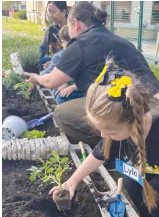
Preschoolers and staff at Vicenza Elementary School in Italy work in a new planter bed.

Talks with Scouting America yielded reforms to align its programs with a Trump executive order, resulting in a new partnership agreement under which the organization