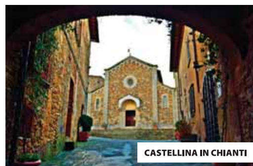
CASTELLINA IN CHIANTI