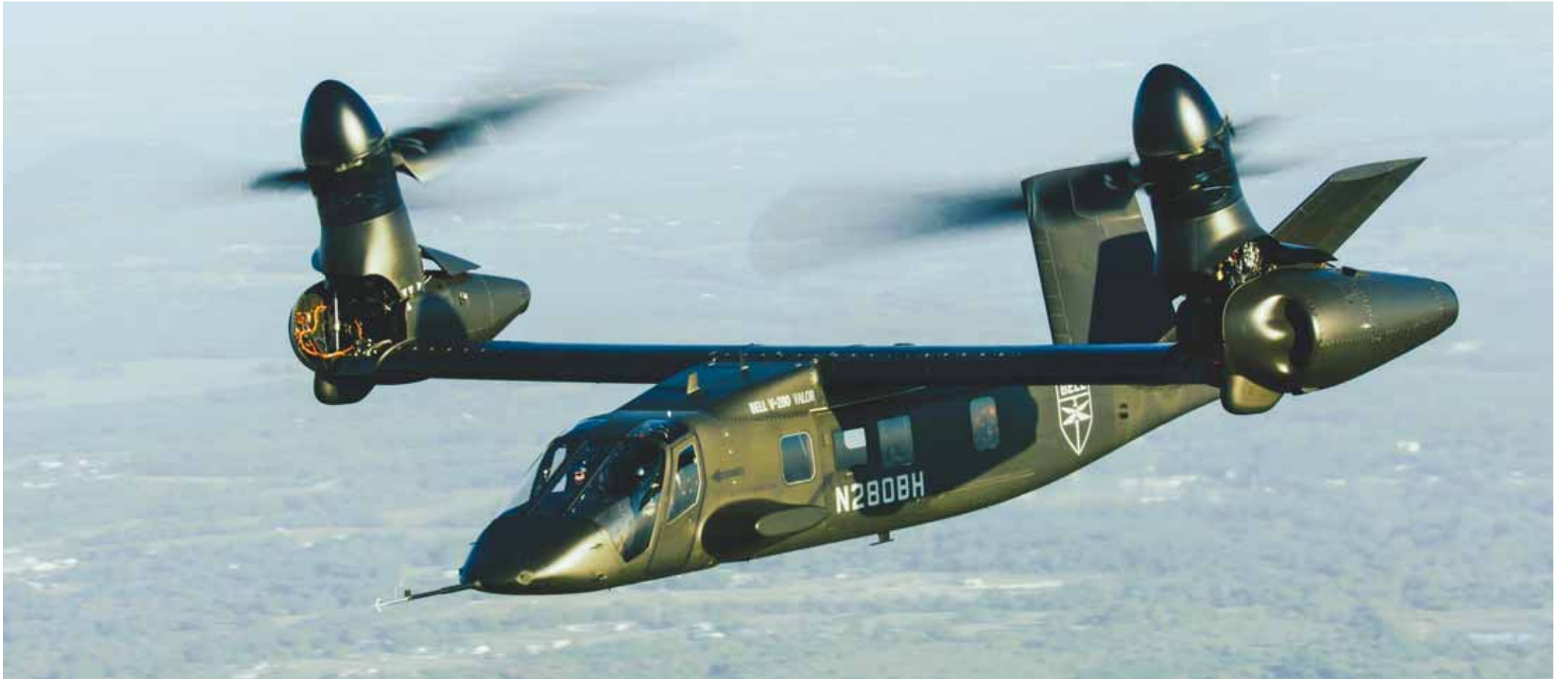
The V-280 Valor, prototype of the Army's planned MV-75 Future Long-Range Assault Aircraft that's designed to replace the UH-60 Black Hawk.