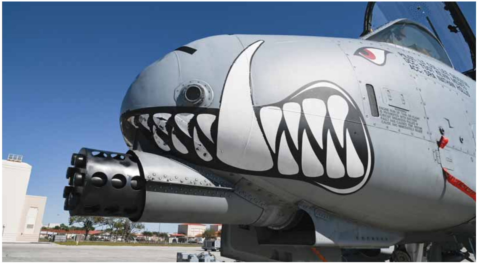
STERLING SUTTON/U.S. Air Force

Armed with a GAU-8 30 mm cannon firing 3,900 rounds per minute, it was originally intended as a Cold War-era Soviet tank bus-