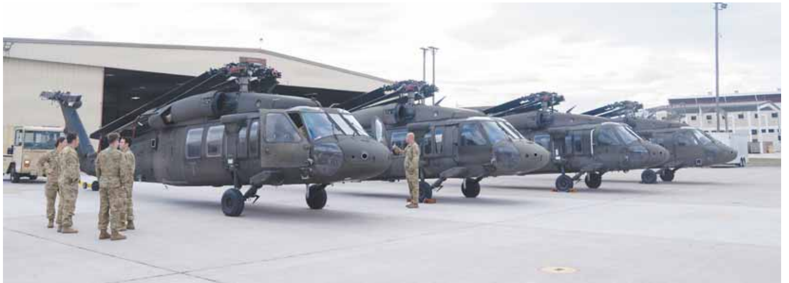
ALEXANDER MERCHAK/U.S. Army