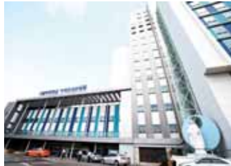
THE CATHOLIC UNIVERSITY OF KOREA YEUIDO ST. MARY'S HOSPITAL

MAIN MEDICAL FIELDS: Eye Hospital, Lymphoma Center, Orthopedics, Urology, Geriatric Psychiatry, Gastroenterology Center