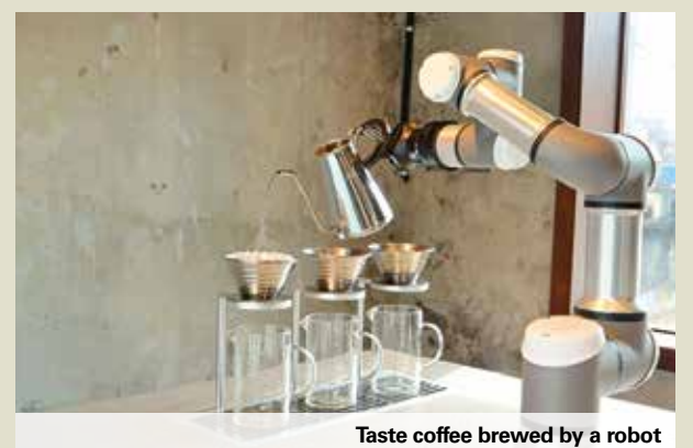
Taste coffee brewed by a robot