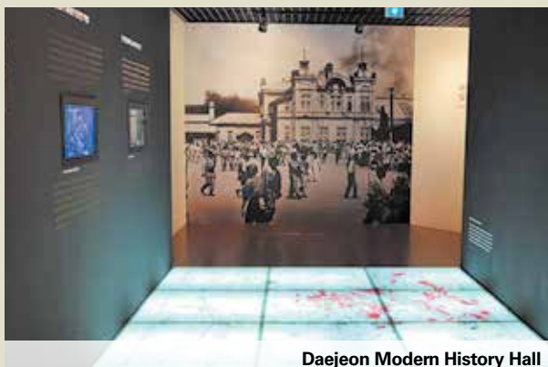
Daejeon Modern History Hall