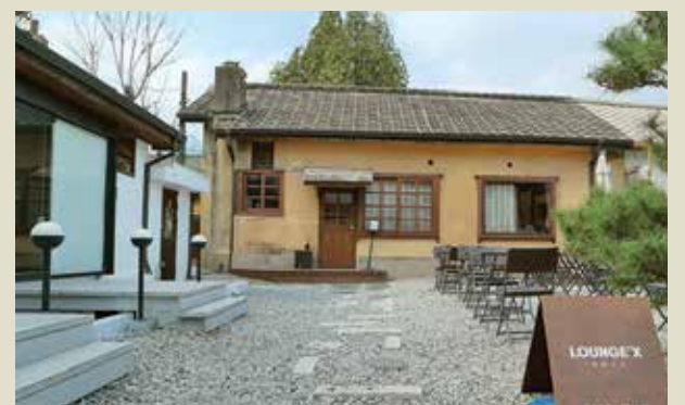
Gwansa Villages No. 16

Efforts to achieve conservation and development together are making Daejeon a stronger city. Although it is not overly flashy, the story of the city with its rich history has brought people together, created a new culture, and breathed life into the old city center. New winds have pushed out the stagnant air and the city's true identity has become clearer. With that in mind, Daejeon is being reborn with a new charm.