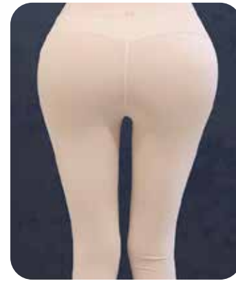
1 month after surgery