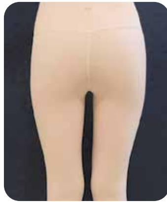
Before Hip-Up Lifting surgery

Korean-style buttock lift, using the medical thread developed in Korea will be a helpful solution for people worldwide struggling with their body lines.