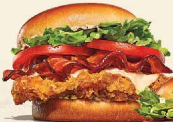
Bacon & Swiss