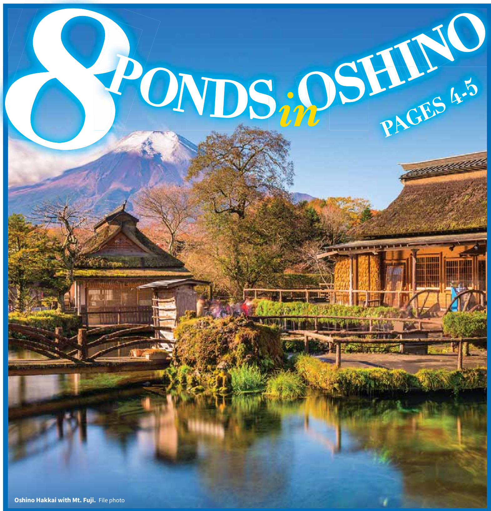
Oshino Hakkai with Mt. Fuji. File photo