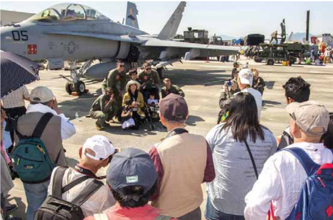
People attend the Friendship Day festival at Marine Corps Air Station Iwakuni, May 5, 2016.