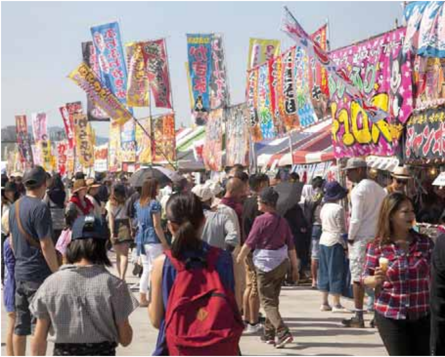
People attend the Friendship Day festival at Marine Corps Air Station Iwakuni, May 5, 2016.