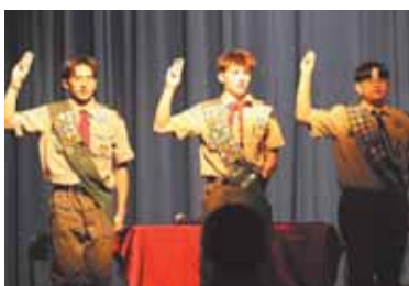
RARE TRIPLE EAGLE SCOUT CEREMONY AT YOKOTA AB PAGE 8