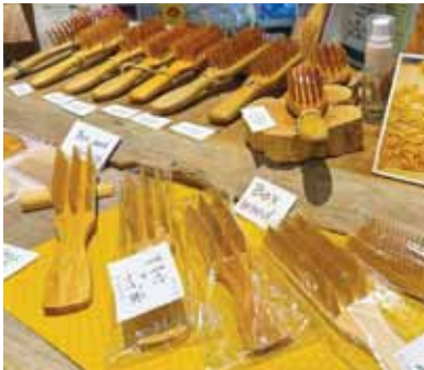
Left: At Blue Trick inside 2k540 Aki-Oka Artisan, each pair of jeans and every jacket feels like its own canvas. Above: Hand-crafted combs at Ganma take three to four days to complete from raw material to finished product.

Each pair of jeans and every jacket feels like its own canvas. Various pieces of fabric in varying shades are stitched together in visible layers. No two items are alike, and the prices reflect the artistry, up to 45,000 yen, or about $300, for a single pair of jeans. A few steps down, you'll find Ganma, a woodcraft shop filled with hand-carved combs, charms and decorative pieces. The sales representative briefly walked me