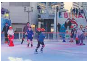
ENJOY ICE SKATING NEAR CAMP ZAMA AND NAF ATSUGI PAGE 6