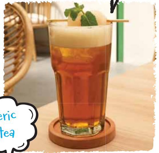
Turmeric mint tea

disease to increase. But eating healthy can be expensive! To cut the cost, try sticking to local eats. We have five healthy recipes you can make with local produce. We're not saying to throw away your barbecue grill. But try mixing things up every once in a while by trying out the recipes below. You might find them delicious enough to forget they're healthy.