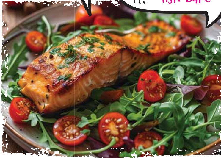
Arugula kimchi fish bake