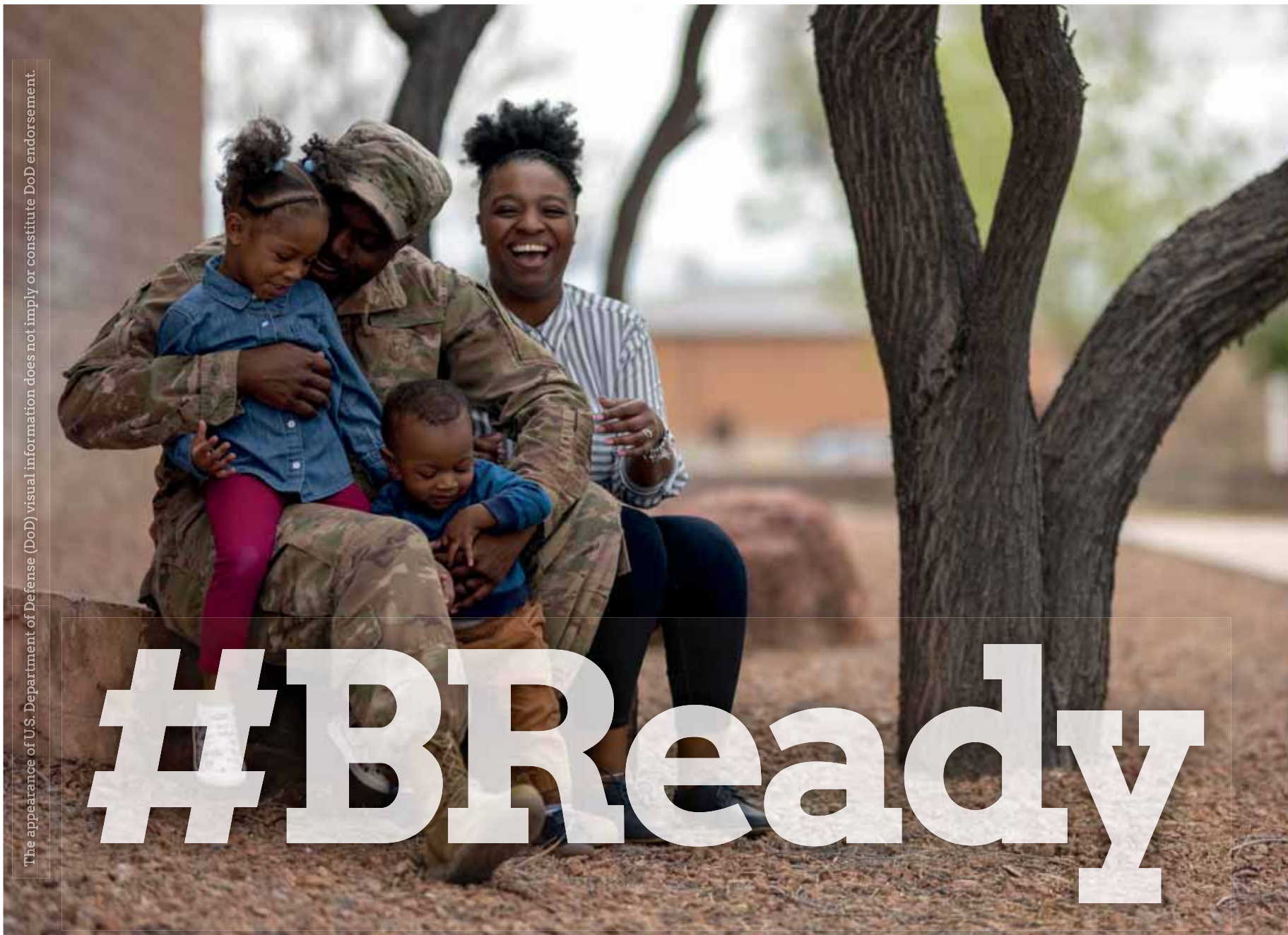
The appearance of U.S. Department of Defense (DoD) visual information does not imply or constitute DoD endorsement.

The B in our name stands for Benefits . Our group life insurance and financial services are all about readiness for whatever life brings your way. Turn to the USBA team for trusted assistance on how to help secure your family's future. For over 60 years, we have helped Military personnel and their families #BReady.