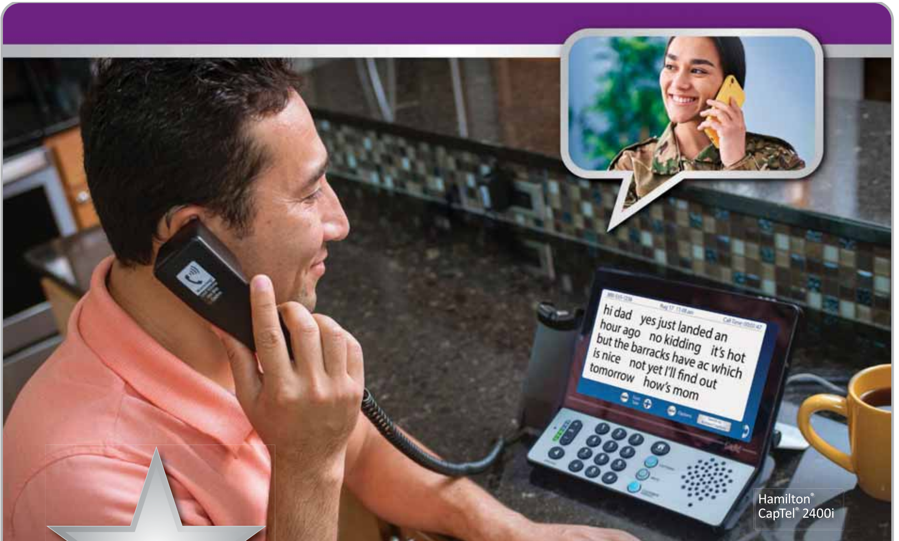
Hamilton® CapTel® 2400i