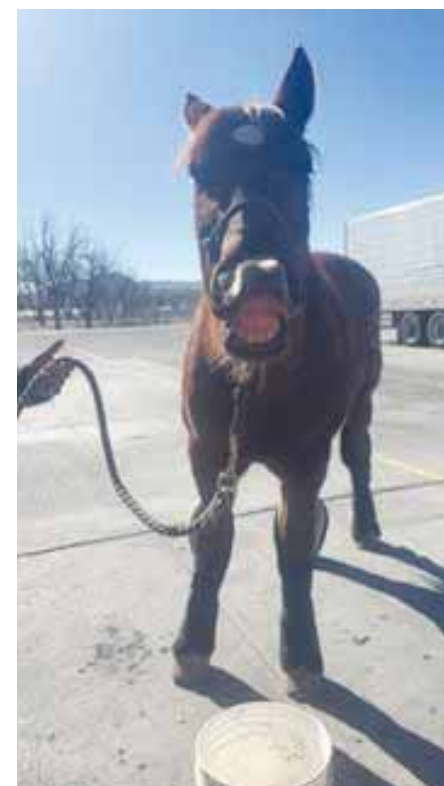
Sully takes a water break during a stop near Albuquerque, N.M.

"They've already made friends with the current horses and are enjoying the Kansas grass and more than 200 acres of their new home," he said.