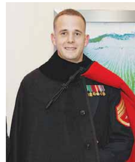
TIA DUFOUR/U.S. Marine Corps

It is now an optional seabag item that will be issued upon entry, so members