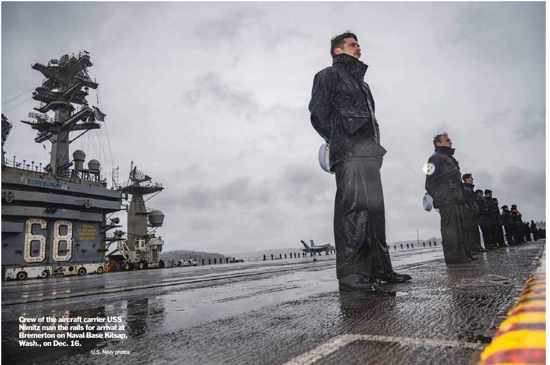
Crew of the aircraft carrier USS Nimitz man the rails for arrival at Bremerton on Naval Base Kitsap, Wash., on Dec. 16.