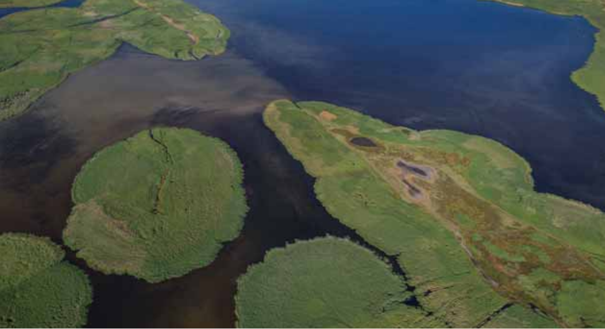
LEFT: Aerial view of the Danube River Delta. BOTTOM LEFT: The famous Transfăgărășan road.