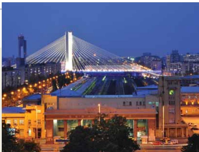
RIGHT: Basarab bridge and railroad station in Bucharest. BOTTOM: Concert hall in the Romanian Athenaeum.