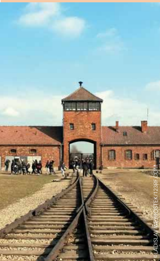
LEFT: Auschwitz Rail Entrance was used from 1942 until late 1944, deliver- ing Jews from all over German-occu- pied Europe by crowded freight trains RIGHT: A watch tower, on the site of the Aus- chwitz-Birke- nau State Museum.