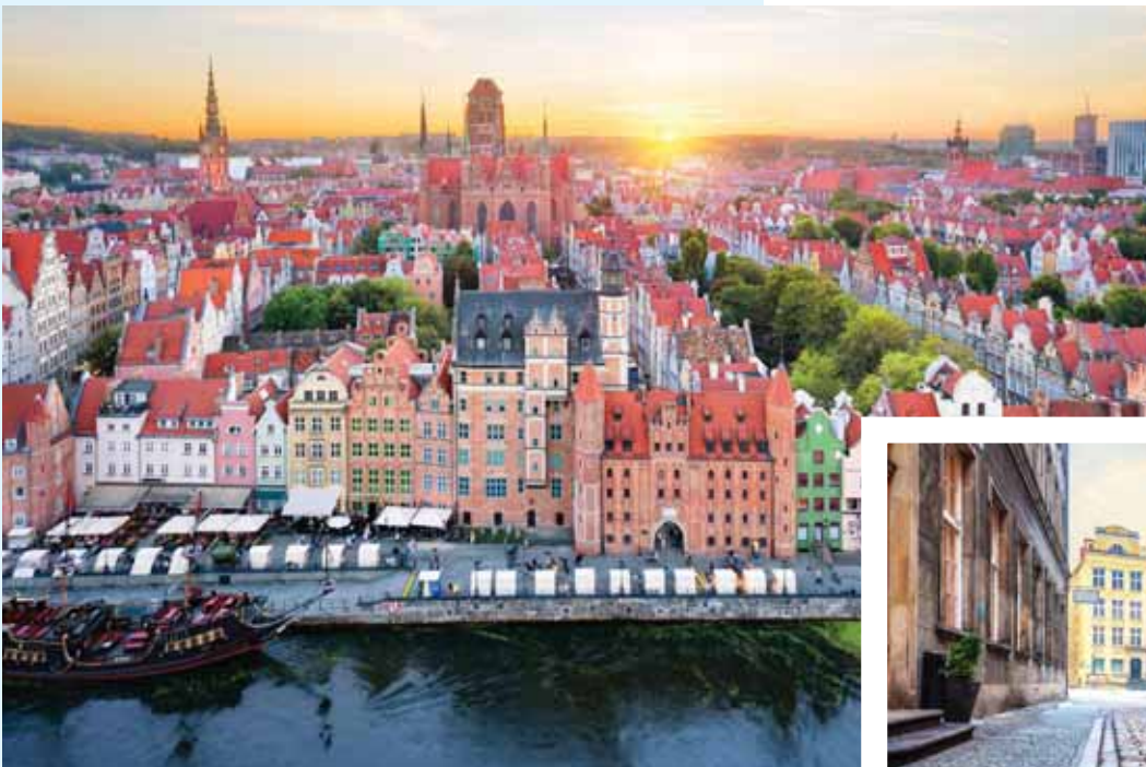
LEFT: Aerial view of Old Town Gdańsk

As one of the oldest cities in Poland, the stunning coastal city of Gdańsk is full of stories and history. Ruled by Prussians, Germans and Poles, the combined cultural influence can be felt everywhere. From the moment you arrive, you'll notice a stark resemblance to the Dutch capital, Amsterdam. Tall, gabled facades tower over the cobblestone streets below. The city center, or Main Town, is home to the imposing St. Mary's Basilica, Neptune's Fountain, the storied Long Market and shops featuring exquisite amber jewelry from local artists. Because of the old town feel, it's easy to confuse Main Town with the actual Old Town, which is a quaint and quiet area just north of the more touristy part of the city.