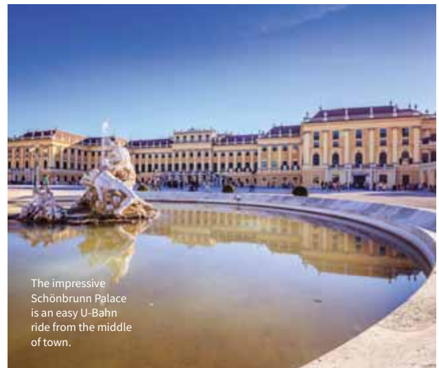
The impressive Schönbrunn Palace is an easy U-Bahn ride from the middle of town.