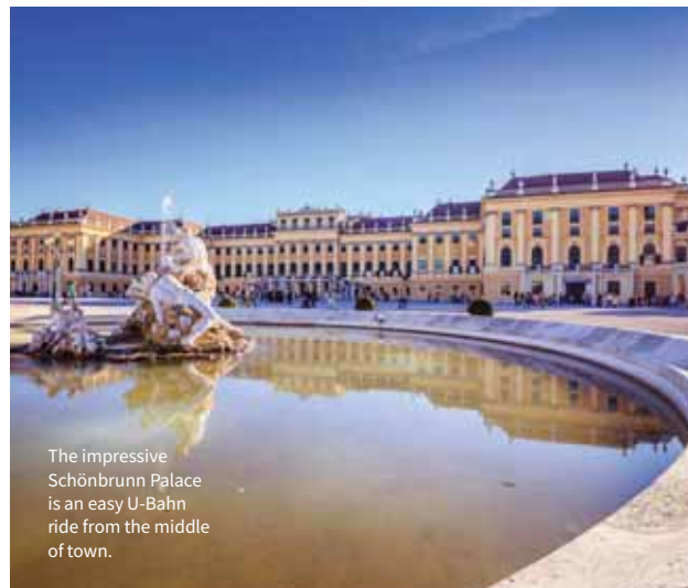
The impressive Schönbrunn Palace is an easy U-Bahn ride from the middle of town.