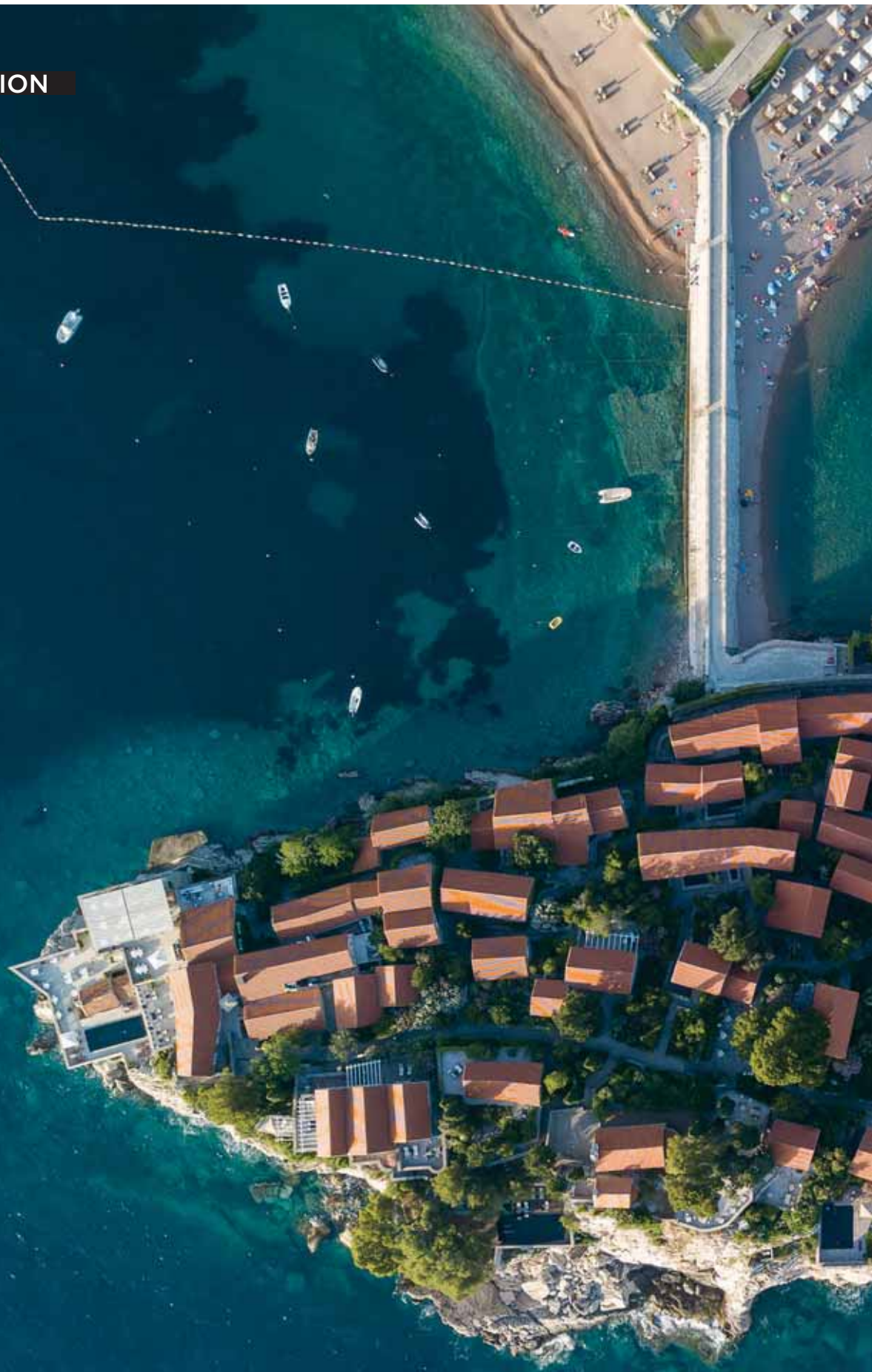
Aerial photo of Sveti Stefan island in Budva.