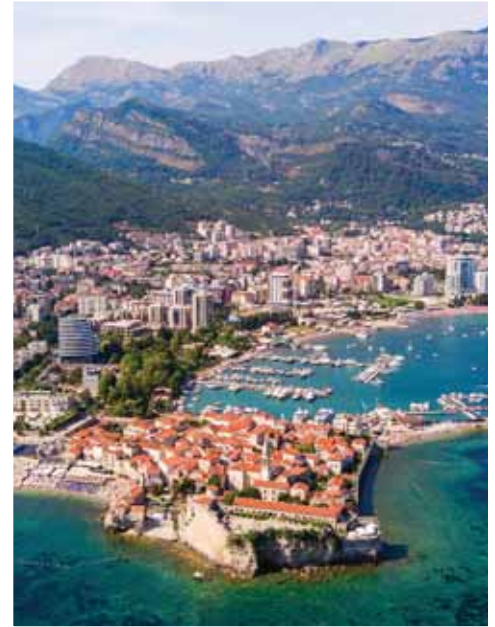
BOTTOM: Aerial view of Budva.