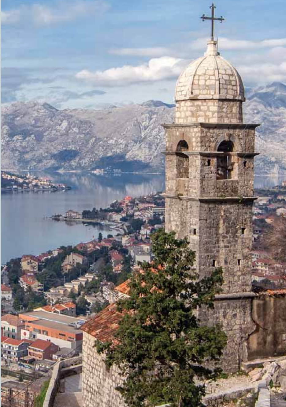
LEFT: Bay of Kotor view from Lovcen mountain.

“Montenegro is quickly becoming the spot to go, seen as a cheaper yet rewarding locale compared to the French Riviera, Monaco and other Mediterranean spots.”