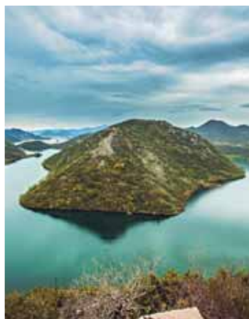
CLOCKWISE FROM LEFT: Durmitor mountains at sunset, river rafting in Tara Canyon, Rijeka Crnojevic River bend at Skadar Lake National Park.