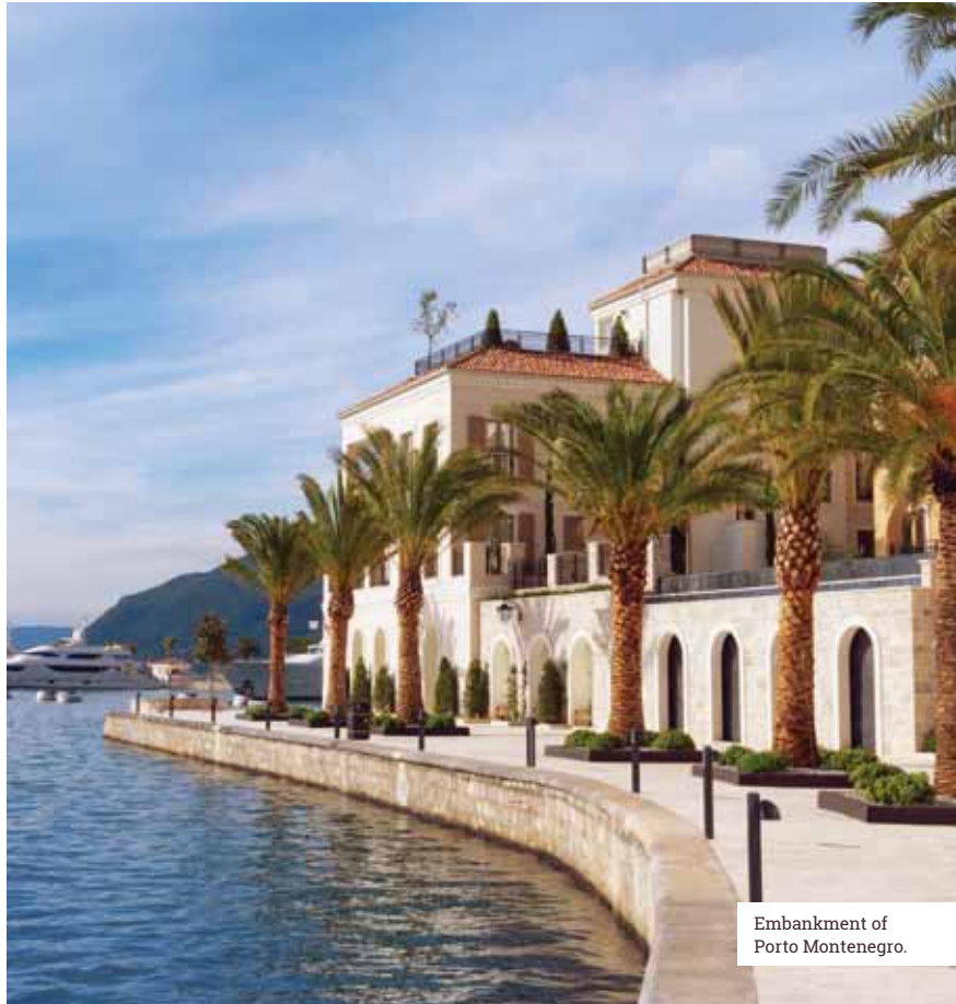
Embankment of Porto Montenegro.

Walking along the port itself gives an air of elegance without breaking your budget. Elbow rub amongst the elite at the Porto Montenegro Yacht Club, which boasts a stunning, crystal-clear infinity pool overlooking the bay. Once you've taken a few hours to unwind, head to the waterfront and check out some of the local museums. Many offer a fascinating look into the history of Tivat and Montenegro as they are located in the former homes of aristocrats, religious clergy and royalty dating back centuries. Take a stroll through the tall evergreens of Spomenik Spasiću i Mašeri Memorial Park and adjacent Veliki Gradski Park. Or head out on the water and take a glimpse of the golden colors of sunset from a boat cruise or rented boat.