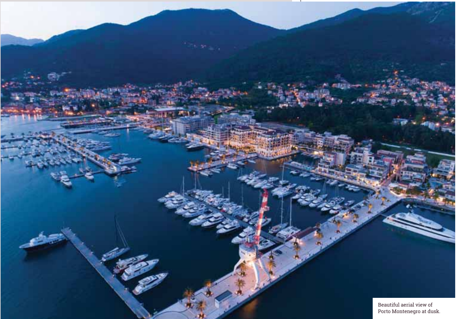
Beautiful aerial view of Porto Montenegro at dusk.

Set within the calmness of Boka Bay along the sun-drenched Montenegrin coastline is Porto Montenegro. At first glance, it appears to be a destination for well-heeled yacht dwellers. However, its rich and complicated past lends itself to the grandeur it has become today. Originally known (and sometimes still referred to) as Tivat, this enchanting area still showcases the influences of the various inhabitants over the centuries, including Serbians, Venetians, Yugoslavs, Romans and Greeks. This upscale neighborhood is a great spot to window-shop and explore, from super yachts moored in the harbor to exquisite fashion houses.