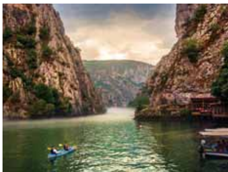
TOP TO BOTTOM: Matka Canyon, Church of Saint John at Kaneo, Mavrovo National Park