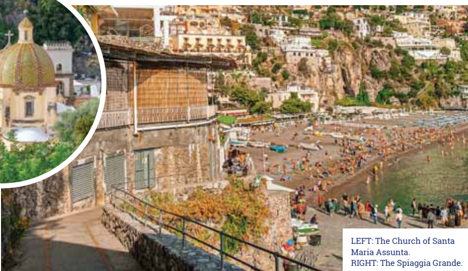
LEFT: The Church of Santa Maria Assunta. RIGHT: The Spiaggia Grande.