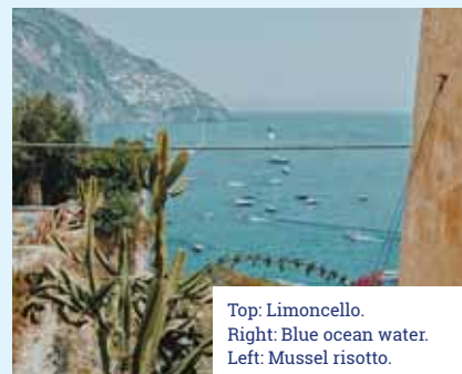
Top: Limoncello. Right: Blue ocean water. Left: Mussel risotto.