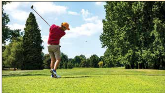
Enjoy a Game Day and two tournament days at the Rheinblick Open on Aug. 4-6.

Cost is $429 per adult, $329 for children (ages