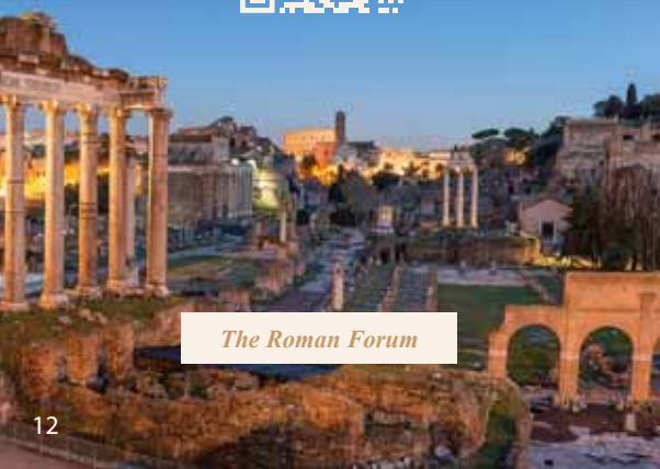
The Roman Forum