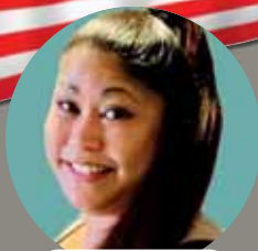
Ara will be your guide