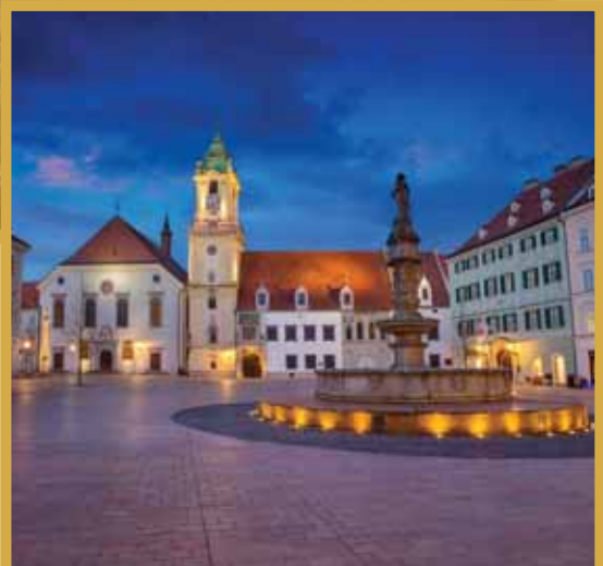
OLD TOWN SQUARE

You can travel into Bratislava by train but be flexible (bring something to read or listen to) if your train is delayed or rerouted. Once you are in the city, you can take the trams around if you need a break, just buy a ticket at a bus stop kiosk or on the tram and validate it when you ride. I recommend spending at least one day exploring the city, but a weekend is even better so you don't find yourself overly exhausted. Trust me, bring good walking shoes because Bratislava is well-known for being pedestrian friendly.