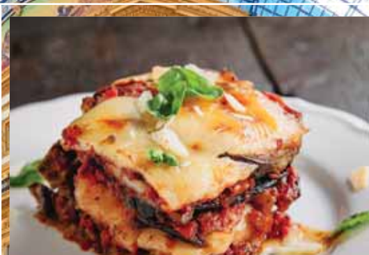
Parmigiana di Melanzane