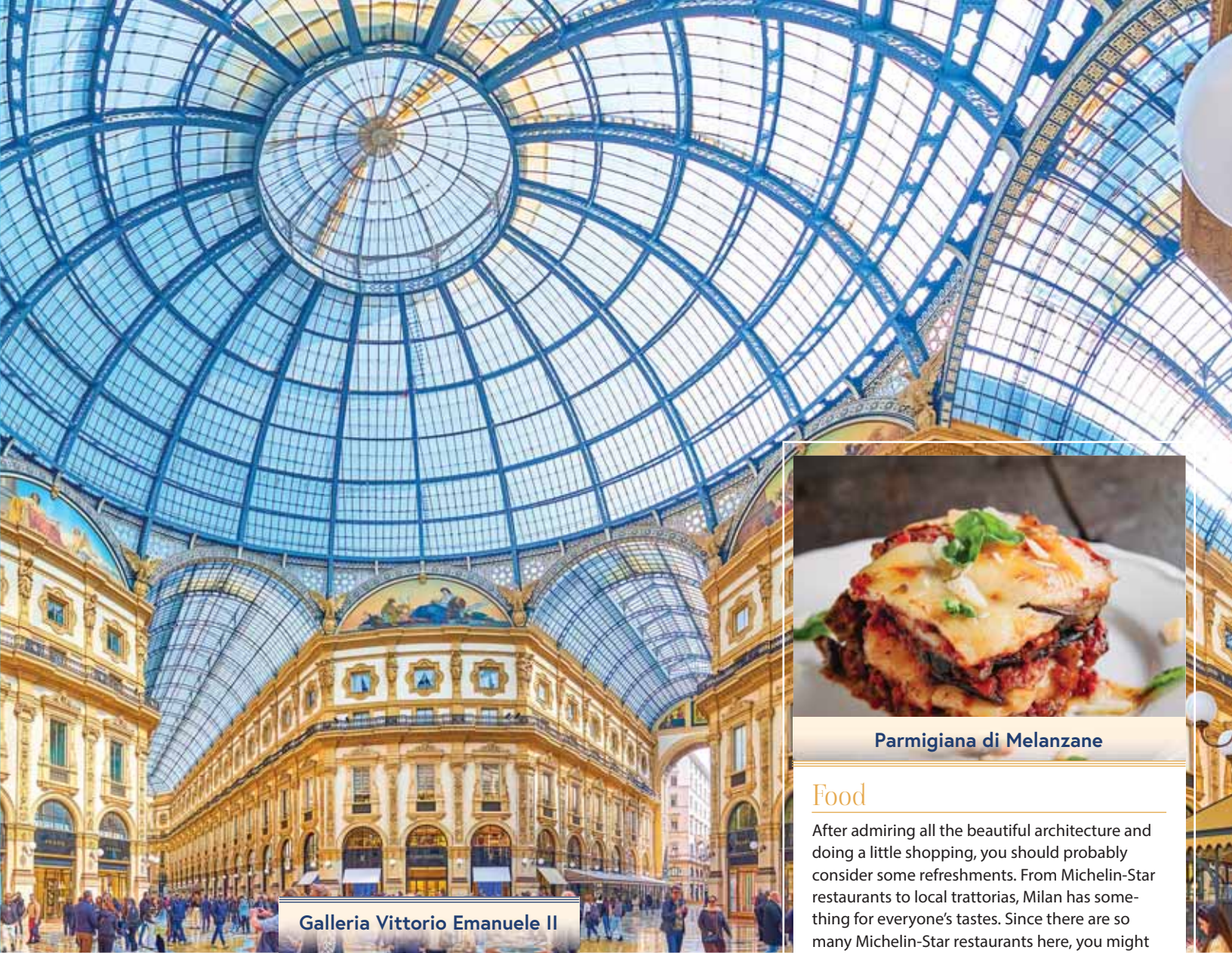
Galleria Vittorio Emanuele II