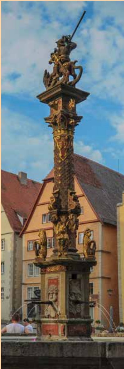
Fountain of St. George in the Marktplatz.