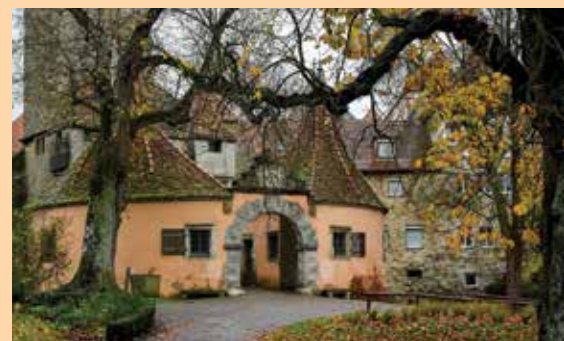
View of Burgtor gate from park Burggarten.

ered with powdered sugar and have been a local specialty for 300 years. Be sure to check out the Fountain of St. George in the Marktplatz. Disney created a duplicate at their German pavilion in EPCOT. Nearby is the headquarters for the Käthe Wohlfahrt Christmas store chain where you can get lost in the massive shop or visit the German Christmas Museum.